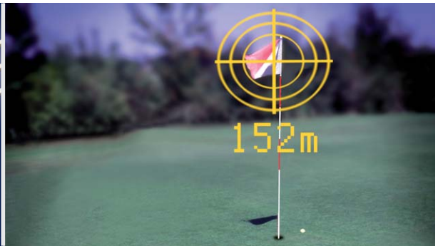
Application example: Handheld laser range finders.