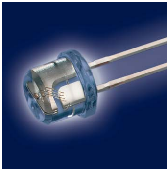
Pulsed laser diode, SPL PL series.