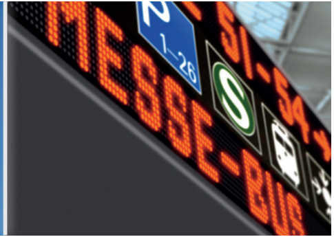
Parking guidance system